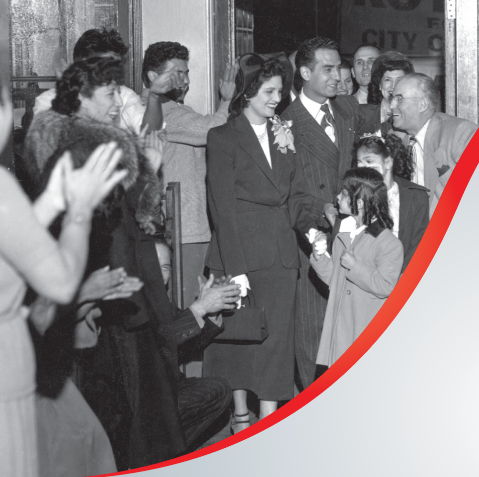
IMAGE: Edward Roybal and his family moments after winning election to the Los Angeles City Council. Roybal served 13 years on city council, championing education and housing for immigrants. He went on to be the first Latino in the US House of Representatives since 1879.