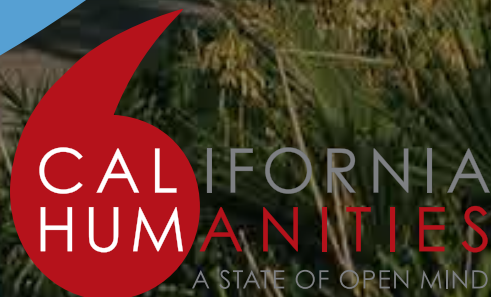
IMAGE: MacArthur Park, Los Angeles from the NHC22 Conference invitation video.