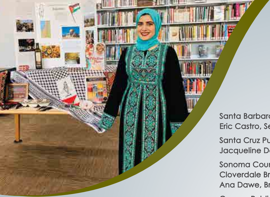
IMAGE: Moreno Valley Library Palestinian Dance and Embroidery Demonstration event.