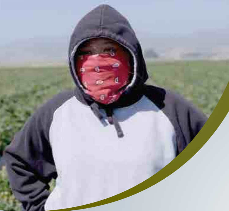
IMAGE: A scene from FRUITS OF LABOR, a coming-of-age story about teen who dreams of graduating high school, when increased ICE raids in her community threaten to separate her family and force her to become the breadwinner.

Litquake Foundation, San Francisco Lit Crawl San Francisco 2021