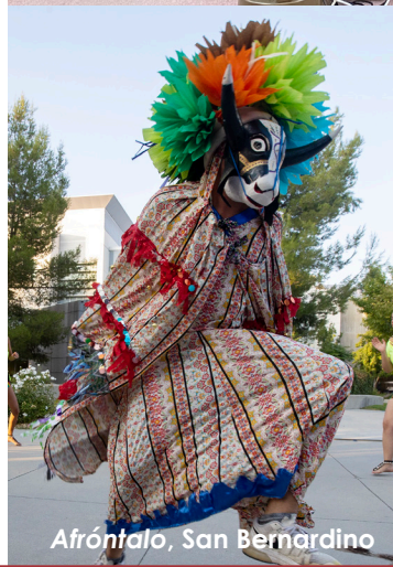
Afróntalo, San Bernardino