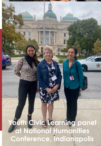
Youth Civic Learning panel at National Humanities Conference, Indianapolis