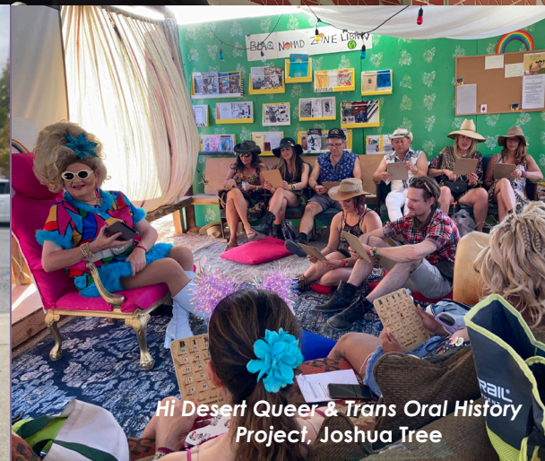
Hi Desert Queer & Trans Oral History Project, Joshua Tree