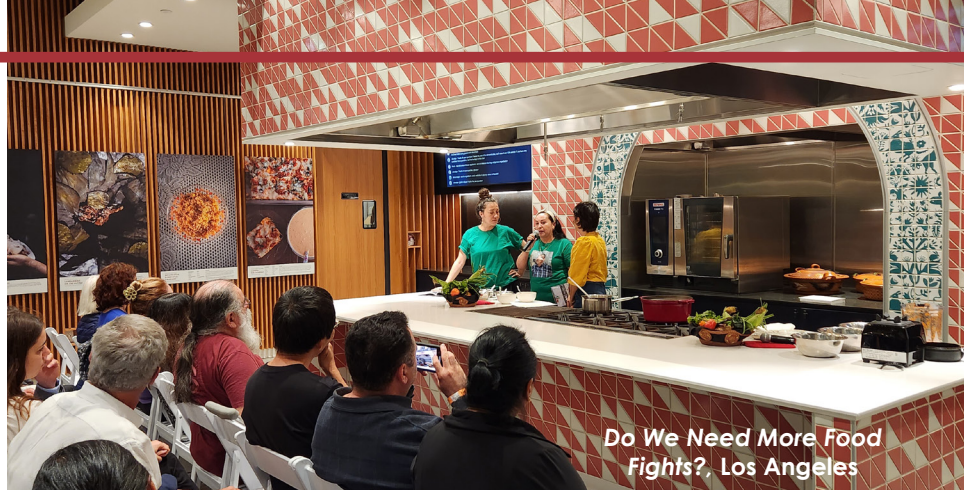
Do We Need More Food Fights?, Los Angeles