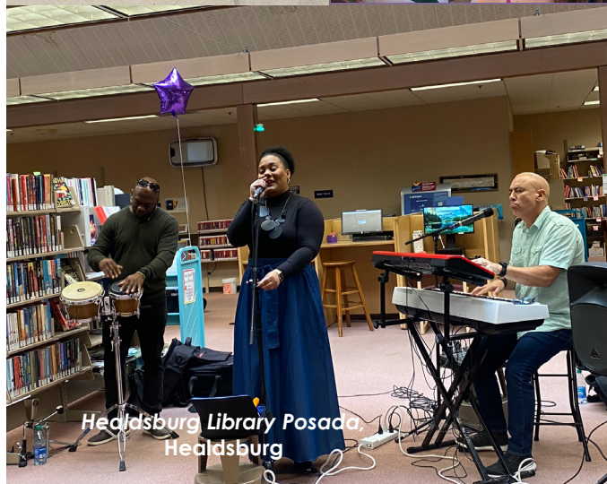
Headlands Library Posada, Headlands