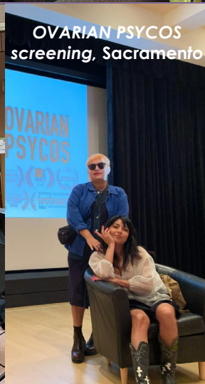
Ovarian Psychos screening, Sacramento