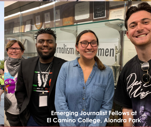
Emerging Journalist Fellows at El Camino College, Alondra Park